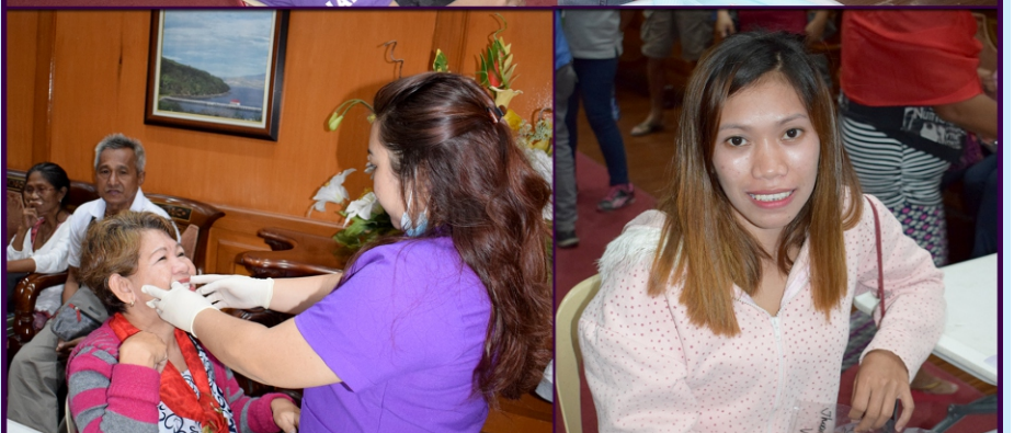
BRINGING BACK SMILE AND CONFIDENCE: Cavite Provincial Government's Libreng Pustiso Program continues to bring back smiles and confidence to its beneficiaries during the awarding of dentures to 72 beneficiaries on July 16, 2019 at the Ceremonial Hall of the Provincial Capitol in Trece Martires City. Facilitated by the Office of the Provincial Governor, the public service initiative caters to Caviteños from all over the province mostly the elders and the less-privileged locals who are incapable of affording their own dentures. Dentures fitting for another batch of 39 beneficiaries was also done during the activity. Recent dentures fitting was likewise held in Cavite City, Cities of General Trias and Imus last July 5 and 10-12, 2019.