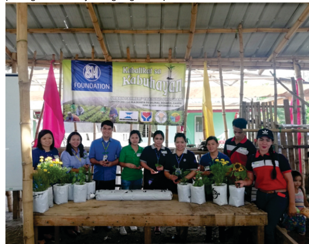
SM City Rosario management, together with the representatives from SM Markets, local government of Rosario and Macondray Philippines did the ceremonial planting to formally start the Kabalik sa Kabuhayan farmer's training.

Samantala, binigyang parangal ang mga mag-aaral at paaralan na nagwagi sa iba't-ibang kumpetisyon na isinagawa paatungkol sa buhay at kagitingan ni Apolinario Mabini.