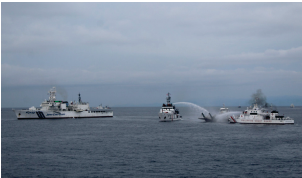
MARINE POLUTION EXERCISE (MARPOLEX) JULY 1-5, 2019. Pinakita ang isa sa eksenang naganap sa naturang pagsasanay sa naganap na Marine Polution Exercise kung papaano tulungan ang isang barkong nasusunog ng tatlong bansa: Philippine Coast Guard, Indonesian Coast Guard at Japan Coast Guard na naganap sa karagatan ng Davao City. Kab ilang na rito ang protection tulong gagawin sa mga pashero ng barko kapag ito ay hinarang sa karagatan ng mga pirate, at Oil Spill Response and Recobery.