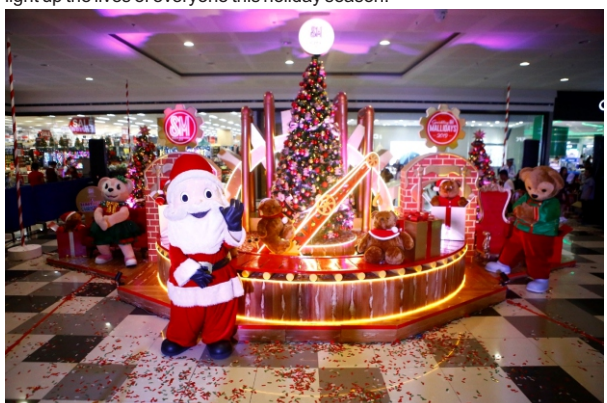
SM Santa danced with his Bear factory workers during the Christmas Centerpiece unveiling at SM City Trece Martin

Christmas is truly the brightest and happiest time of the year From dining to gift shopping, or enjoying fun experiences – for 61 years, SM has witnessed every Filipino family's milestones and celebrations. This year, SM brings you the #SparklingSMallidays as they unwrap a host of funfilled activities, dazzling displays, exciting deals, and thrilling surprises to light up the lives of everyone this holiday season!