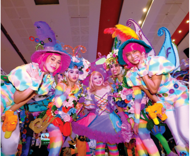
Fairies, Bubble and Umbrella ladies greet the shoppers wearing their sweetest

event center and at the mall grounds to bring happiness and excitement to SM shoppers. Kids were mesmerized by the spectacular performance brought by the colorful sparkling Christmas Characters.