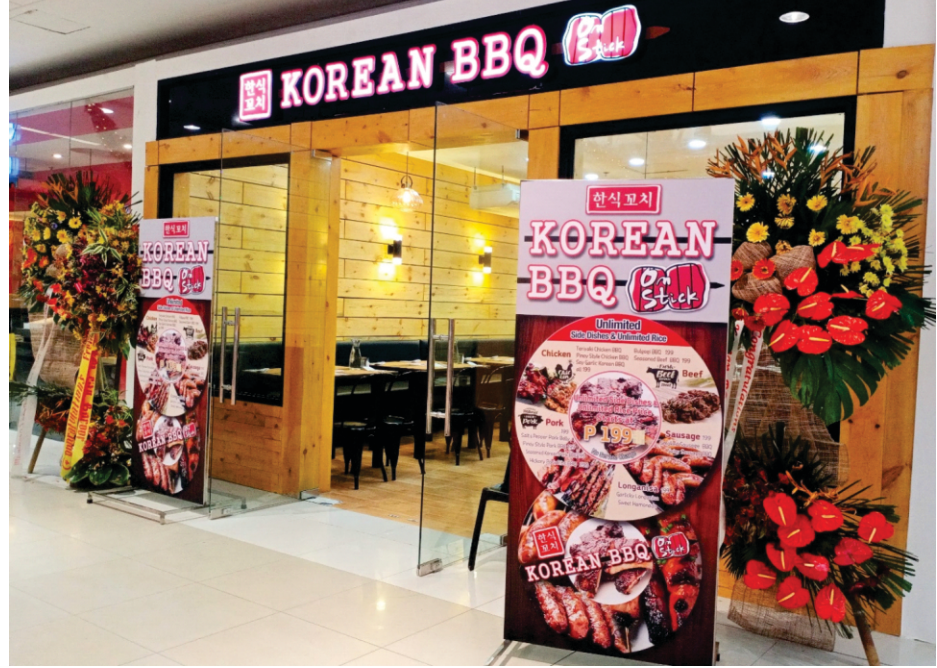
KOREAN BBQ ON STICK, NOW AT SM CITY BACOOR: Who loves Korean Barbecue? Sure everyone do! You can now taste your favorite grilled Korean dishes at the Korean BBQ On Stick at the 3rd Level of SM City Bacoor. Unlimited Side Dishes and Rice starts at Php199! Try their Chicken meat in Teriyaki, Pinoy Style, and Soy Garlic Korean BBQ, their Regular and Seasoned Beef, their Salt & Pepper, Pinoy Style, Seasoned Korean and Hickory Pork, as well as their famous sausages now!

HUNGRY JO-MO, NOW OPEN AT SM CITY BACOOR: Hungry yet? Hungry Jo-Mo is waiting for you at SM City Bacoor 2nd Level to satisfy your cravings for Asian Grill dishes. Go unlimited and enjoy their sumptuous meal as you enjoy catching up with friends and bonding with your family. Hurry and grill with Hungry Jo-Mo today!