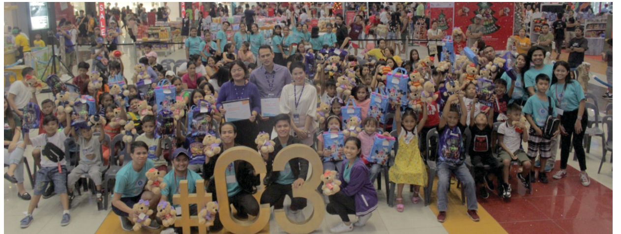
The Children Christmas Concert was full of fun, excitement and gratitude.

Children's Christmas Concert, is making the children feel a different atmosphere and feel the season of love, which is Christmas.