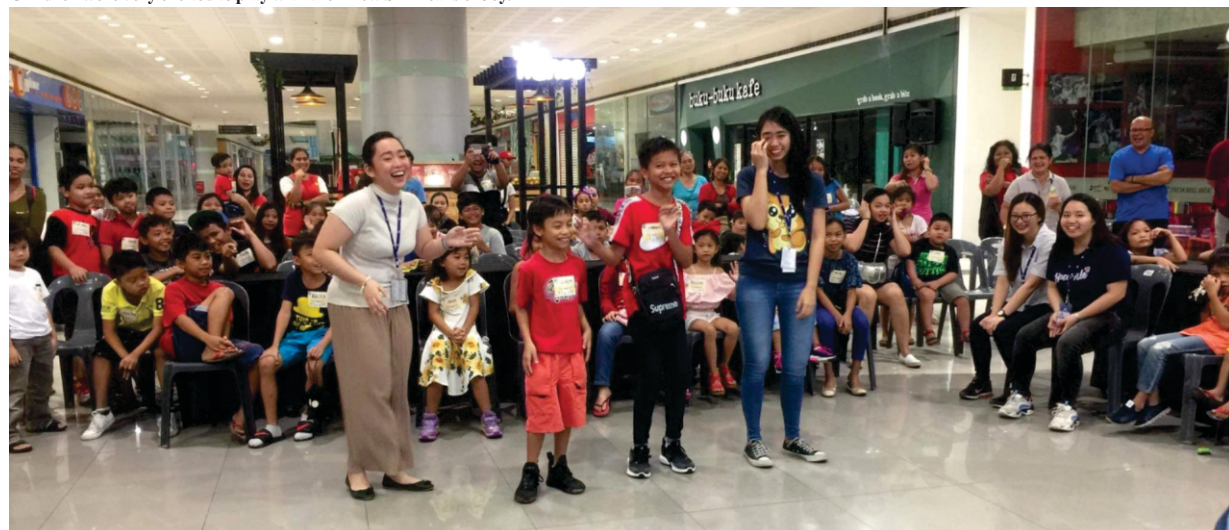
Fun games were held to make the event more fun and exciting.