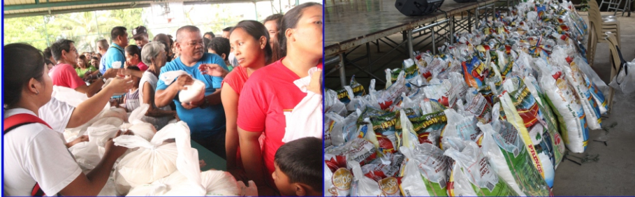
SWIFT RESPONSE TO CONSTITUENTS' NEEDS: Cavite Governor Jonvic Remulla promptly responded during the onslaught of calamity as he visited the residents of the cities of General Trias, Dasmariñas, and Imus ensuring the safety of his constituents and bringing relief goods to the people. Six thousand five hundred relief goods were distributed to the locals of Sunnybrooke 2 and Tropical Village in Barangay San Francisco in General Trias, another six thousand five hundred packs of rice for the citizens of Zone 2 in Barangay Sampaloc 4 and Barangay Fatima 1 in the City of Dasmariñas and six thousand five hundred relief goods to the residents of Barangay Pag-asa 1 and Barangay Palico 2 in the City of Imus. Governor Remulla echoed his commitment to ease the burden of the people and swore to bring quality service to the indigent members of the community. He also encouraged everyone to call the attention of their respective leaders to immediately respond on emergencies and disasters which can help save lives and properties of the citizens. The governor also brought good news to the public as he explained the fiber optic internet connection in Cavite with more than 300 kilometers of fiber optic cables spread throughout the province making it a free wi-fi zone. The governor highlighted the importance of modernizing information technology and going with the flow of innovation which mirrors economic development in the province. Together with the governor who showed enthusiasm and compassion to their constituents were General Trias Mayor Ony Ferrer, General Trias Vice Mayor Morit Sison, 4th District Board Member Fulgencio Dela Cuesta, Cavite Councilors League President Nickol Austria, 3rd District Representative AA Advincula, 3rd District Board Members Jeffrey Asistio and Dennis Lacson , city and barangay councilors and punong barangay of the three recipient cities. (PICAD)