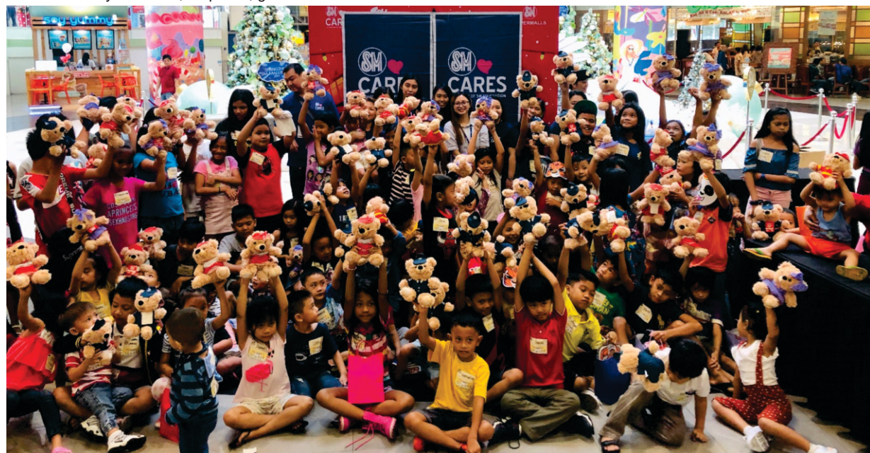
Children were very excited to play with their new SM Bears of Joy.

these children making them feel Christmas is always here. Over a hundred children were able to experienced VIP treats from the Mall administration volunteers; giving them gifts, serving them delicious food, letting them ride on the Mall train and played with them.