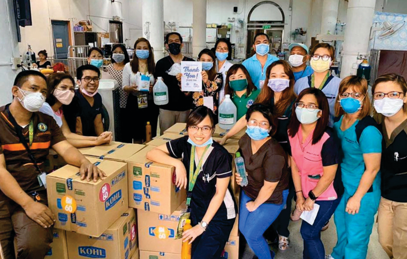
SM FOUNDATION, NAGHANDOG NG MEDICAL SUPPLIES SA MGA OSPITAL LABAN SA COVID-19: Bilang suporta sa mas pinaigting na laban ng mga Medical Frontliners sa lumalalang pagkalat ng COronaVIrus Disease 2019 (COVID-19) pandemic, nagsimula nang maghatid ng mga medical supplies sa iba't ibang ospital at medical instituions sa kalakhang Maynila at karatig bayan ang SM Group sa pangunguna ng SM Foundation (SMFI). Mahigit kumulang 20,000 N95 masks, 2,500 gallons ng alcohol, 100 face shields, at 100 sets ng N95 masks at goggles na ang naipamahagi sa 18 ospital at medical institutions na kasalukuyang nangangalaga sa mga pasyenteng tinanan ng sakit at mga nakakaranas ng sintomas nito. Ito ay parte ng ipinangakong tulong ng SM Group na naglaan ng Php100 million na tulong para sa paglaban sa sakit na COVID-19.Bago ito, inanunsyo na ng kumpanya ang naunang tulong sa mga tenants nito sa buong bansa sa pamamagitan ng hindi pagsingil ng upa, patuloy na pagpapasahod sa mga emplayado nito, at pamamahagi ng tulong pinansiyal bilang Emergency Financial Assistance sa kanilang mga frontliners na security guards at janitor sa kabuuan ng

Aside from the houses, the SM Cares Village also has amenities such as street lamps, sewage treatment plant, materials recovery facility, rain-catchment system and provisions for water and electricity.