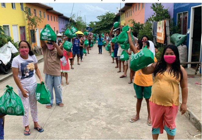
Families from the SM Cares Village in Concepcion, IloIlo are all smiles after receiving their food packs from SM Foundation. Inc

ng pamahalaan para sa panawagang tulong sa mga middle income earners na umaaray na rin dahil sa epekto ng COVID-19 pandemic.