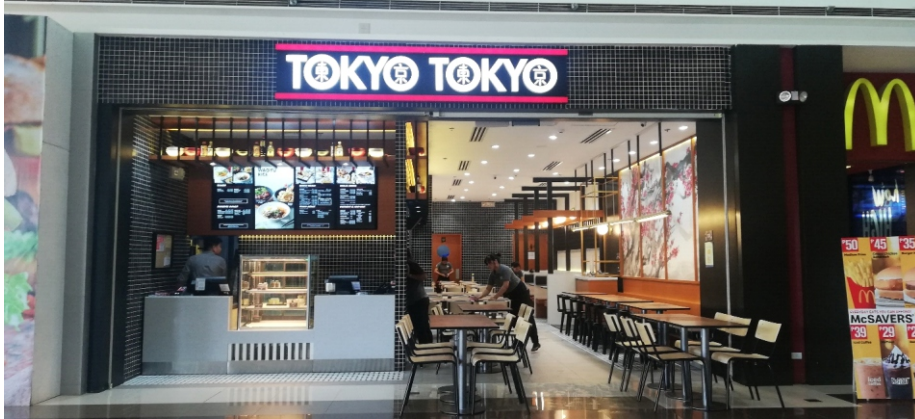
The #1 Japanese food chain, TOKYO TOKYO is now serving SM City Rosario's shoppers of high-quality Japanese dishes, bringing Japan closer to Filipinos. Located at the ground floor level of SM City Rosario.