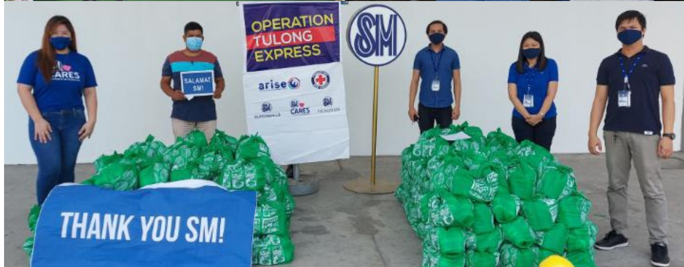
THANK YOU SM! SM Foundation together with SM City Dasmariñas, SM Marketmall, SM City Trece Martires and SM City Rosario turn-over kalinga packs to some barangay in Dasmariñas, Trece Martires and Rosario Cavite amid COVID-19 crisis.