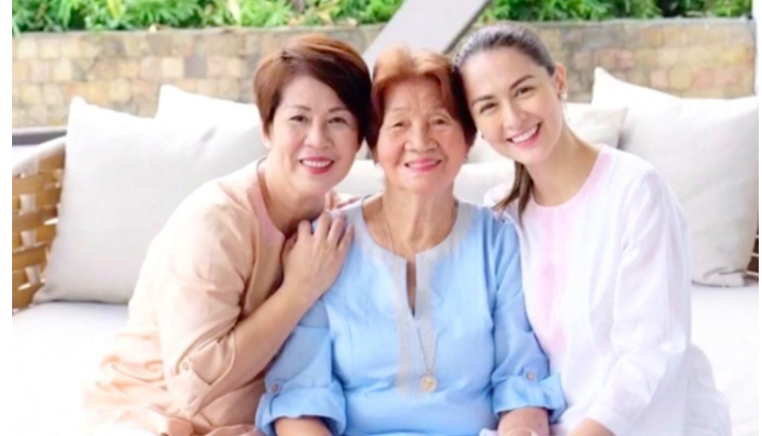
Marian Rivera with her two moms: her lola whom she considers her nanay and puso ng tahanan and her mom whom she is very close with and considers her best friend.

For your advertising and subscription needs, please call or text Waterfront News through this numbers 0922-2607076/(046)424-68-70