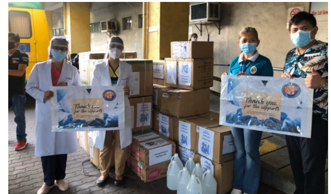
The grateful Doctors and Front liners of Amang Rodriguez Medical Center – Marikina upon receiving the PPEs and Medical Supplies donation from SM Foundation

Other hospitals who were also recipient of the said donations in Cavite are General Emilio Aguinaldo Memorial Hospital, Binakayan Hospital and Medical Center, San Pedro Calungsod Medical Center-Kawit, and De La Salle-Dasma Hospital, while three hospitals in Rizal including Manila East Medical Center-Taytay, Marikina Valley Medical Center and Amang Rodriguez Medical Center – Marikina received the same