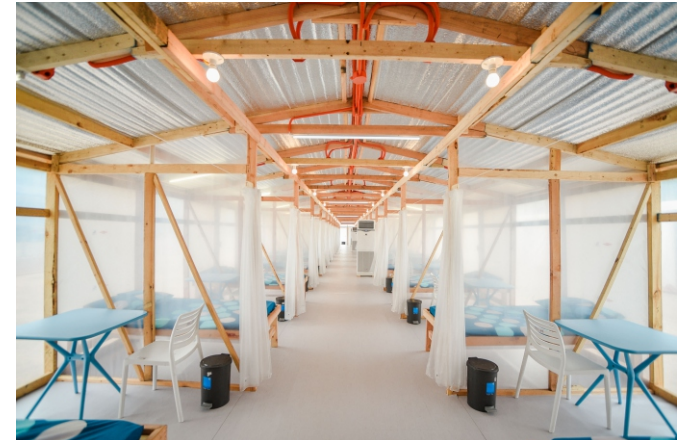
The interior of one of the Camp Crame facilities, which like the rest features beds, airconditioning units, ceiling fans, exhaust fans, restrooms, shower areas, and nurse lounges.

SMFI's Leadership Team expressed gratitude to SM EDD volunteers for carrying out its purpose and commitment to provide EQFs to its partners in the uniformed service.