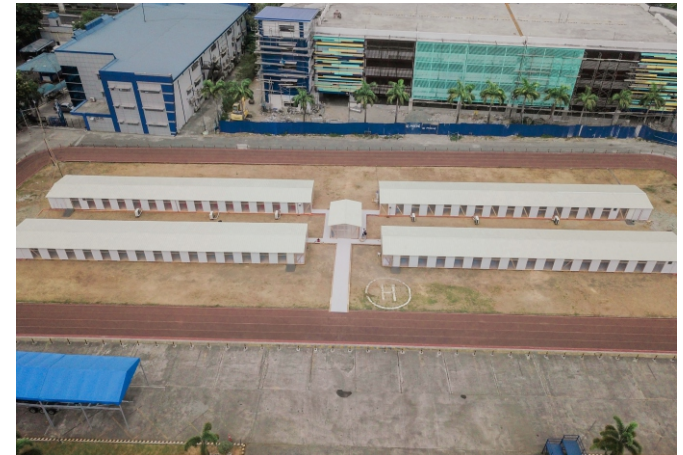
SM EDD and WTA Architecture and Design Studio built four facilities in Camp Crame in Quezon City.