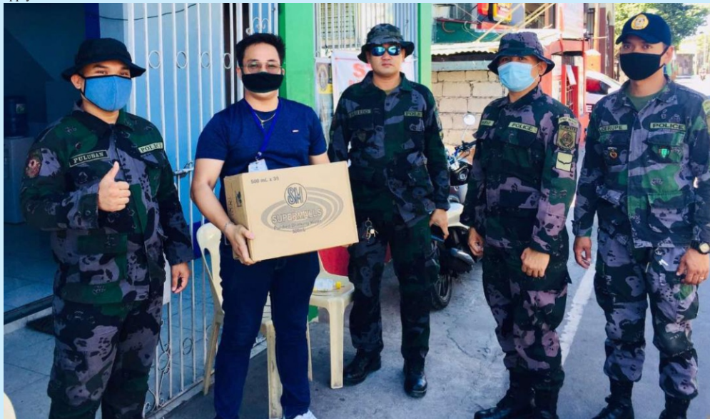
Amid Corona Virus threat, SM City Rosario continuously give SM Bonus bottled water and snacks to frontliners at checkpoints nearby. This simple act of kindness brought a huge smile behind the frontliners' mask, who never give up to serving and protecting the people.

Carmona LGU launches Carmona COVID-19 Assistance Program (CCAP): The local government of Carmona announces the launch of the Carmona COVID-19 Assistance Program (CCAP) on May 9, 2020. CCAP is the P2,000 financial assistance of the local government for households in Carmona who were not able to receive any cash subsidy from the national government such as the Social Amelioration Program (SAP). The announcement posted on the local government's social media sites contain the qualifications and process on how to apply for CCAP.