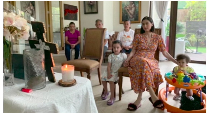
Marian instills in her family and kasambahay the importance of praying together and to have faith in God which her nanay taught her.