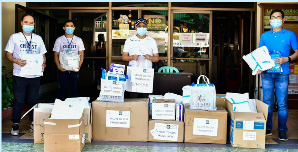
Donors continue the spirit of #BayanihanMunaLagi this COVID-19 season: On May 9, 2020, donors from the public and private sectors continue to help Carmona rontliners through various donations.

Vol. IX: No. 42 P10 CIRCULATED NATIONWIDE May 6 - 12, 2020