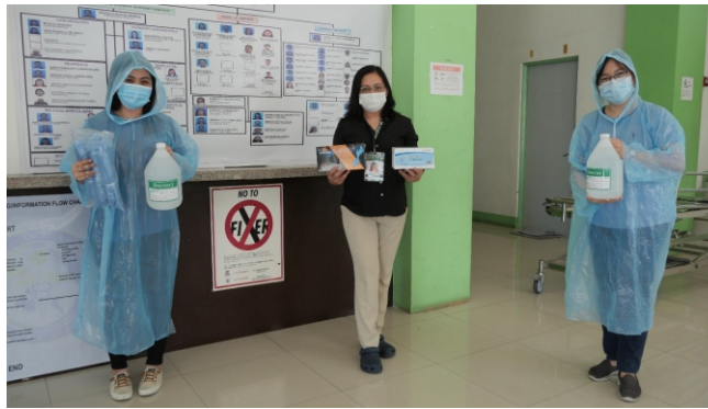
Southern Tagalog Regional Hospital Receiving the donations from SM Foundation

In line with its commitment to be of service to the Filipino public, its hospitals, and its government during the coronavirus pandemic, SM Foundation recently donated Personal Protective Equipment and medical supplies to hospitals in Cavite and Rizal. These include PPEs, N95 and surgical masks, gloves, raincoats, goggles, as well as alcohol and hygiene kits, which are part of the P170 million SM has allocated for this purpose. Among the hospitals that received the donations is Southern Tagalog Regional Hospital in Bacoor, Cavite which was formerly upgraded into a General Hospital, recognizing the health needs and aspiring to make health services readily available and accessible 24/7 to the residents of the whole province.