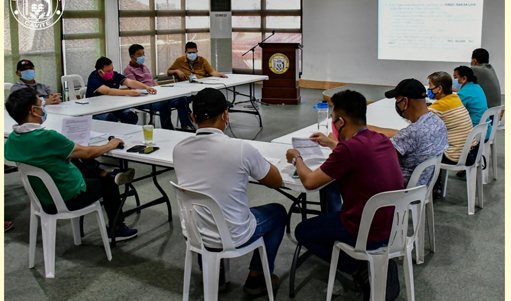
The local government of Carmona held a meeting with the Sangguniang Bayan members on May 8, 2020 at the Municipal Penthouse to tackle the Carmona COVID-19 Assistance Program (CCAP). CCAP is the P2,000 financial assistance of the local government for households in Carmona who were not able to receive any cash subsidy from the national government such as the Social Amelioration Program (SAP).