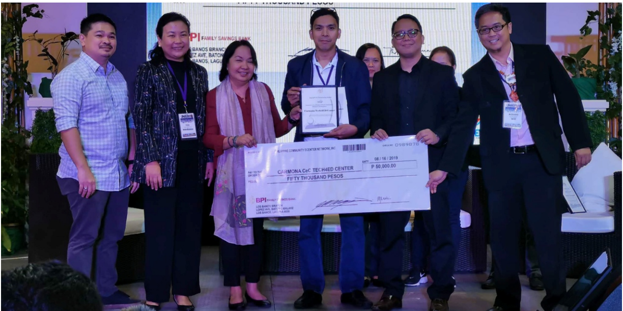
Carmona wins at 14th Knowledge Exchange Conference: The Carmona IT unit won the 2019 QPL ICT Innovation Award at the recently concluded 14th Knowledge Exchange Conference held at Puerto Princesa City, Palawan on August 16, 2019. This is in recognition of the innovative use of modern ICTs for community and manpower development.

WATERFRONTNEWS: AUGUST 21, 28 & SEPTEMBER 4, 2019