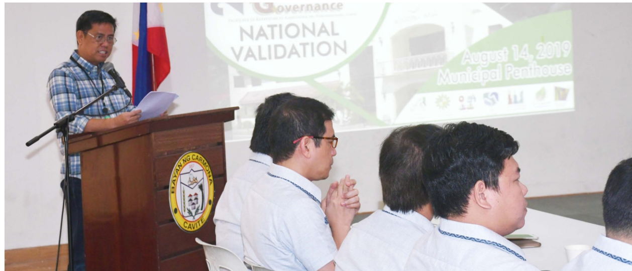
DILG visits Carmona for SGLG National Validation: On August 14, 2019, a national validation for the Seal of Good Local Governance (SGLG) was conducted in Carmona by the Department of Interior and Local Governance (DILG). This validation is annually conducted as an instrument in promoting the imperatives of good governance, setting high standards of service and management in the local government unit. The validation includes interviews, document reviews, and site visits in which the aspects of financial administration, disaster preparedness, social protection, peace & order, business-friendliness & competitiveness, environmental management, and tourism, culture & arts were inspected. Carmona had received four SGLG awards since 2015 and is vying for its fifth award this year.