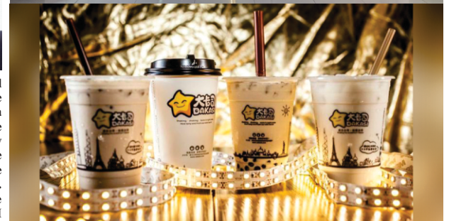
Dakasi tea, Now Serving at SM City Bacoor: Dakasi Tea at SM City Bacoor 2nd Floor