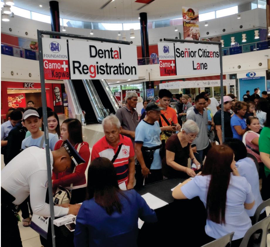
Senior Citizens and some employees queued for the Medical Mission.

Various specialty services such as Internal Medicine, Pediatrics, Ophthalmology, ENT, OB-Gynecology, Urology and Surgery were provided. Blood testing, ECG, ultrasound and Xray were also conducted by the mission. SM Foundation is the heart of the SM group of companies, committed to serve by supporting and empowering communities through education, healthcare, disaster response and farmers' training.