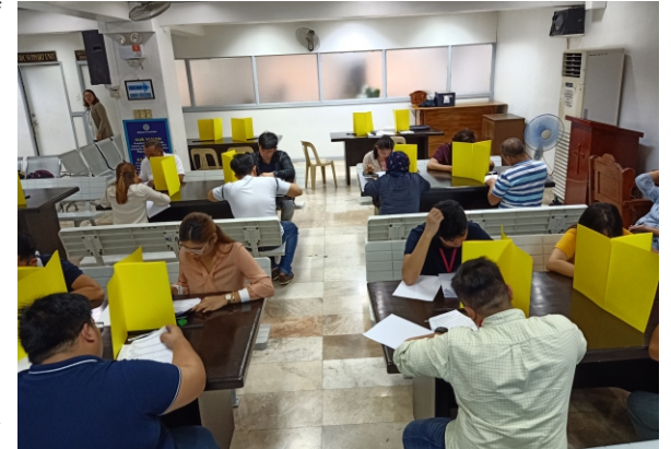
Aspiring Applicants for Customs Operation Officer 1 take their competency based written examination in line with the 10 point priority program of the Bureau of Customs. The examination was held at the conference room of the Manila International Container Port.